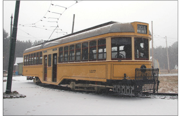
Seashore 30 Dec. 2006