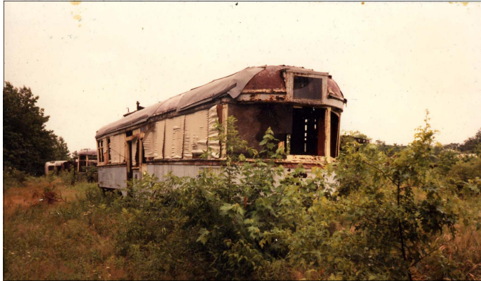
Jobstown, N.J. 1973-1984