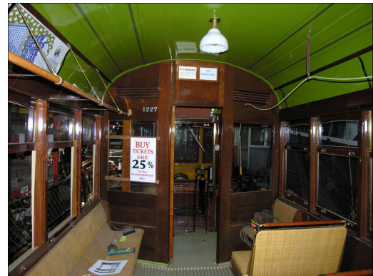
Seashore June 2007

To This! (A. C. Electric Motor Shop, Bangor )Maine