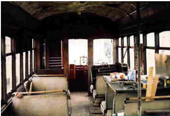
Jobstown c. 1972