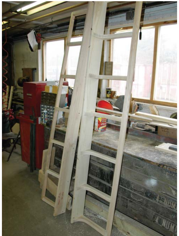
Cleveland Center Entrance Trailer 2365: The second center entrance car receiving work in the shop is the beautiful Cleveland trailer acquired from the Lake Shore Electric museum collection. One of the few remaining tasks to complete the car is fabricating the seats. Here seat frames, identical to those made for motor car 1227, are taking shape and soon will have springs, padding, and rattan covering added.