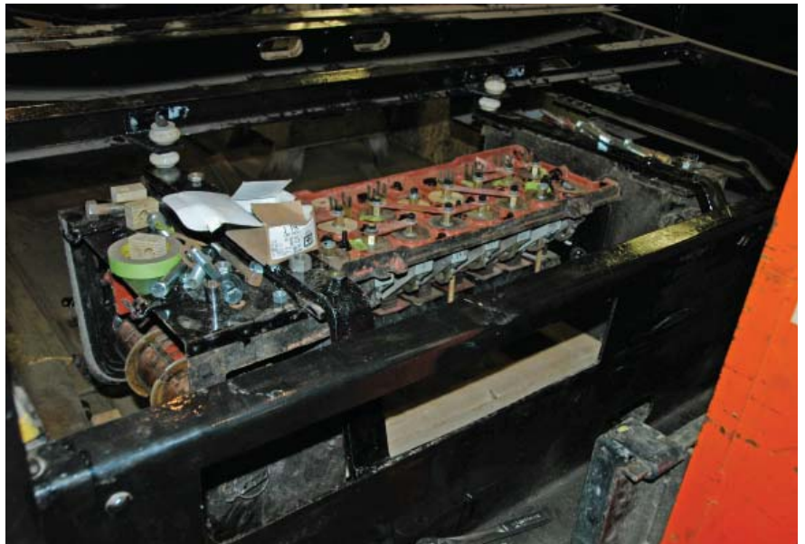
Boston Center Entrance Car 6131: The final pieces of new sheet metal are being aligned and prepared for riveting (left above) and corroded underfloor structural frame members are being built up with welding. Meanwhile, the complicated control switch group (above right) for the car's ABPC 32 multiple unit control has been overhauled and installed below the floor near the center doors.