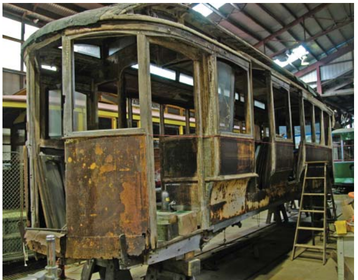
Middlesex & Boston No. 41 has been removed from its truck and the body is being straightened in preparation for structural repairs to the car's framing.