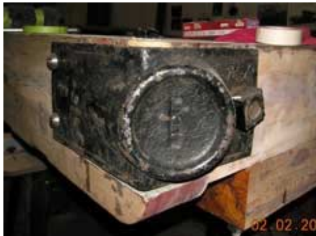
Poling pocket before and after. (Still to be blasted and painted)