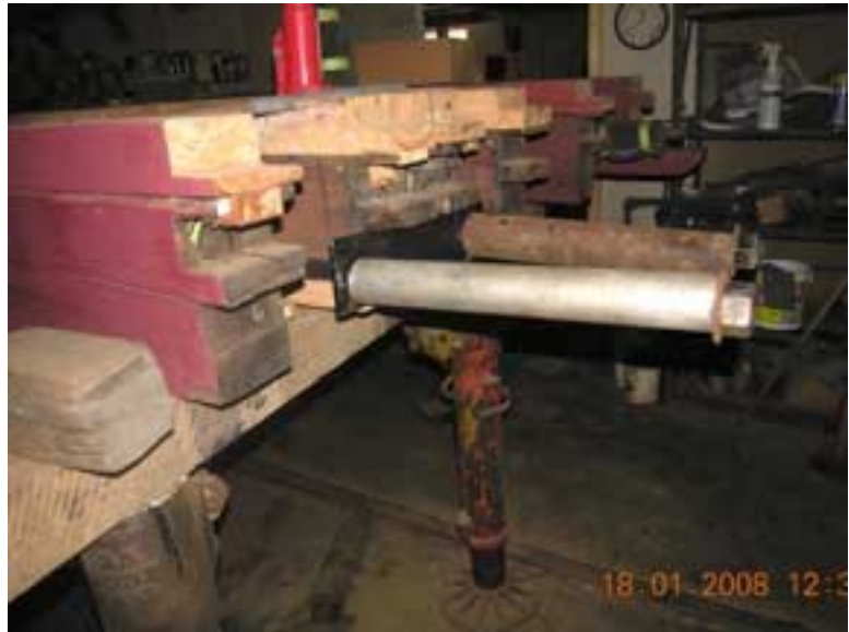
The anchors on the no. 1 end, 31 feet away.

Two weeks later, after the no. 1 sill had been installed, the same process was used again on the no. 2 end and that’s where the end sill, now installed, will remain.