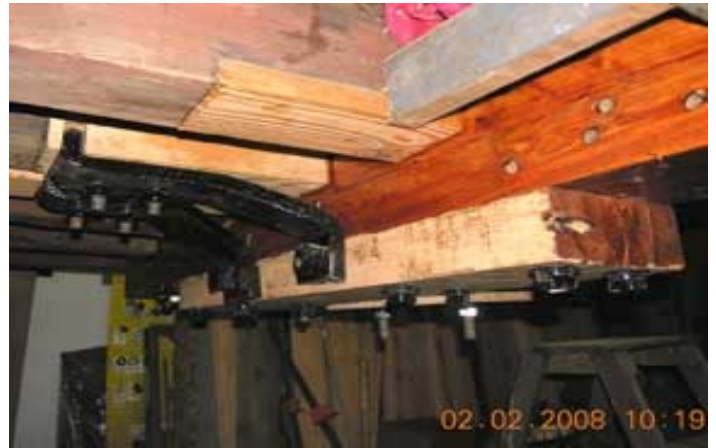
Coupler mounting brackets before and after